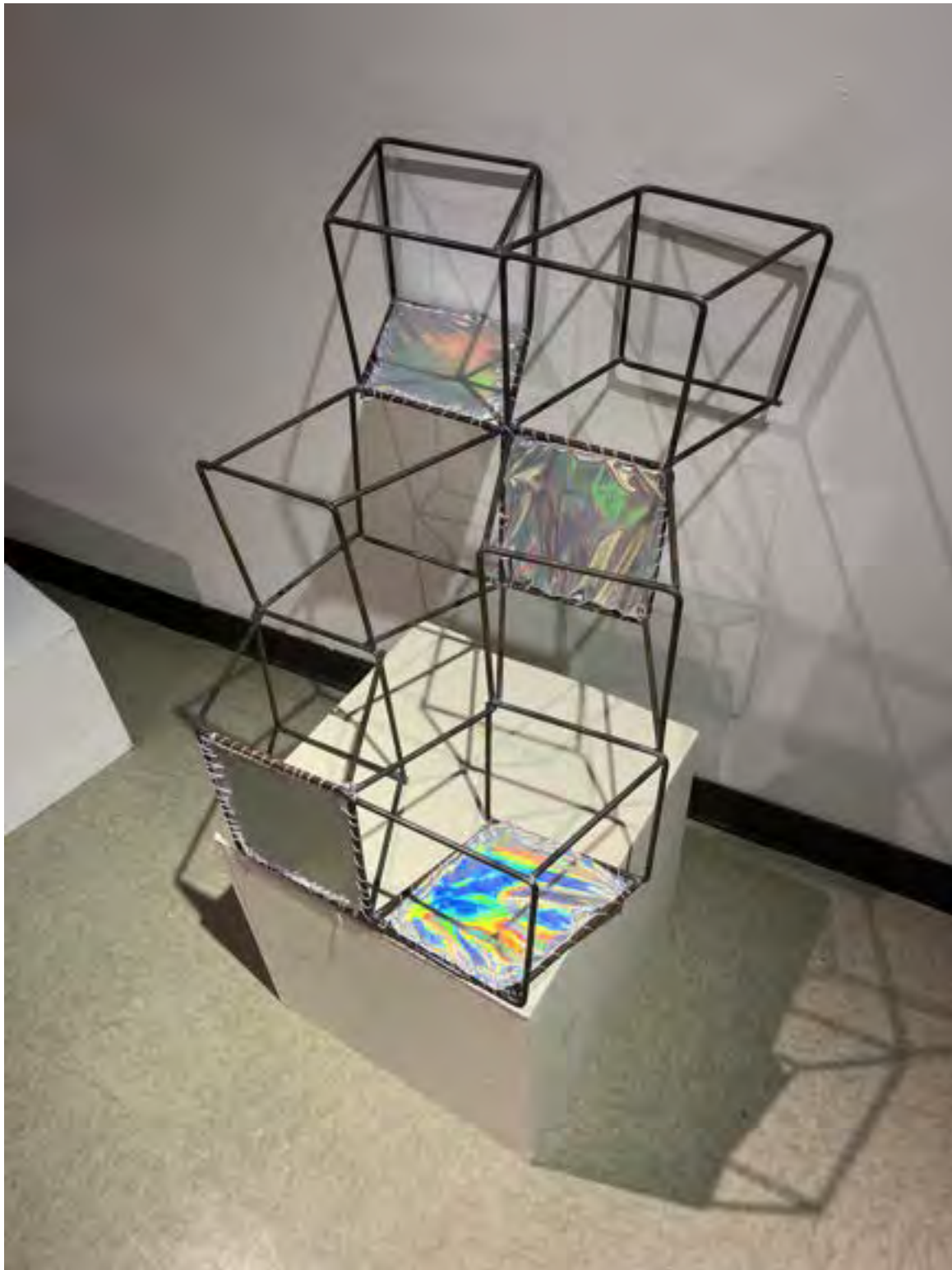
Maddy Arroyo Project: Metal: Skin It! Steel, fabric 2021