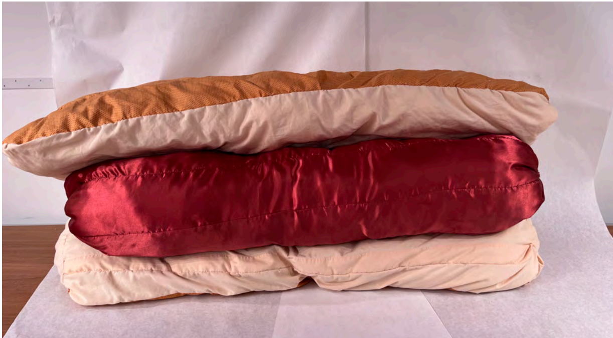
Sofia Sherman Project: Soft Sculpture Fabric, polyfill, thread 2022