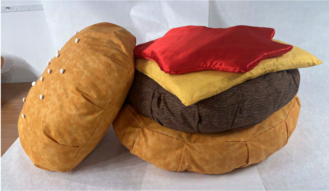
Kayla Remboldt Project: Soft Sculpture Fabric, polyfill, thread 2022