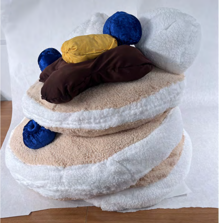
Sagina Vadakal Project: Soft Sculpture Fabric, polyfill, thread 2022