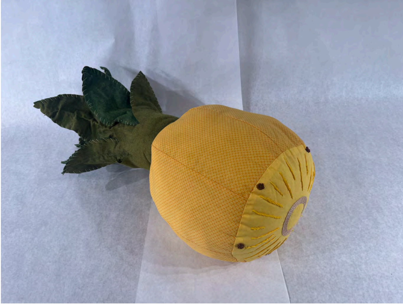
Claire Chang Project: Soft Sculpture Fabric, polyfill, thread 2022